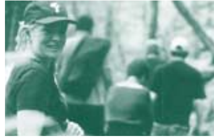
Naturalist Hike, Keystone Science School