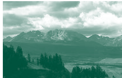
White River National Forest