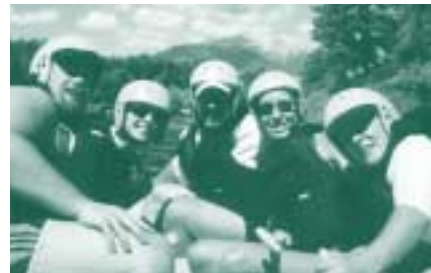
White Water Rafting & Fly-Fishing, Breckenridge Whitewater