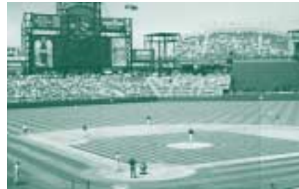
Major League Baseball: The Colorado Rockies